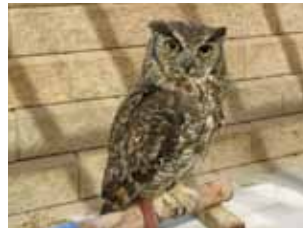
Maxwell (Great-horned Owl) 29 appearances