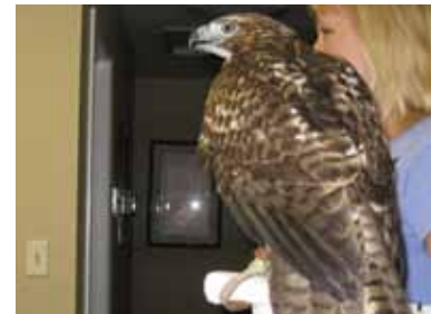
Buddy (Red-tailed Hawk) 9 appearances