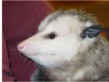
Olivia (Virginia Opossum) 22 appearances