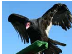
Mr. Handsome (Turkey Vulture) New in 2010 7 appearances