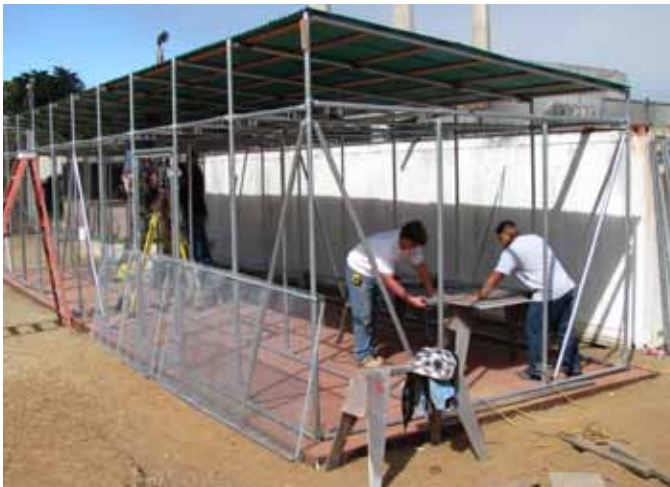
The pad is laid with frame and roof