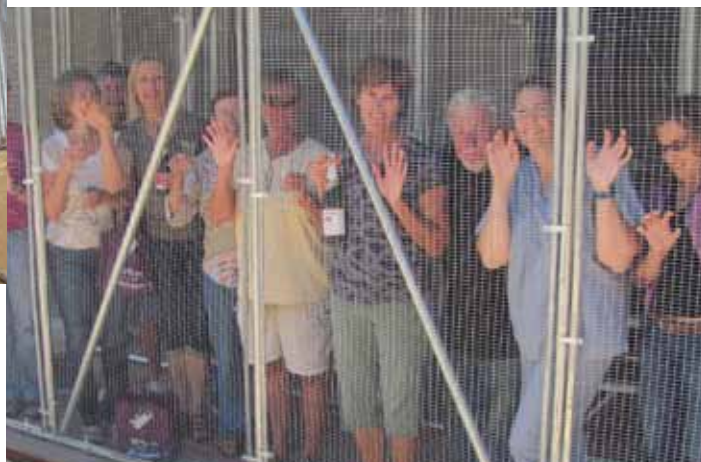
These are not the mammals intended for the new cages! PWC staff and volunteers attended the ribbon-cutting celebration.