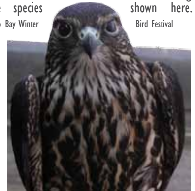
Jack (Merlin Falcon) 14 appearances