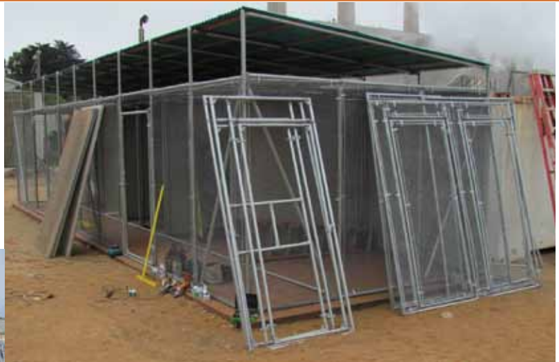
There are nine doors and eight cages with a long access walkway.

At the Third Annual Windows into Wildlife fundraiser in the spring, attendees pledged funds (toward housing for mammals) that totaled over $6,000. With the $7,000 from the event's silent auction and two other $1,000 grants, PWC's new mammal caging was built and completed. All work was done by Dave Barrows with help from Bill Nicholson and Nick Settevendemie. The ribbon-cutting ceremony occurred on August 8 and not a moment too soon: as rehab rabbits, opossums and raccoons immediately moved in!