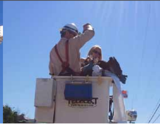
The eagle went for an evaluation and later rehabbed with a raptor specialist

Thanks to these "Special Members" - Our 60 monthly subscribers (from $5 up to $100 per month) who allow PWC to maintain a steady monthly cash flow, thereby helping monthly operating expenses to be met and the Center to remain open and accepting wildlife patients year 'round. Please consider joining this "special" group!