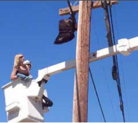
Golden Eagle caught in bracing on a power pole in Paso Robles